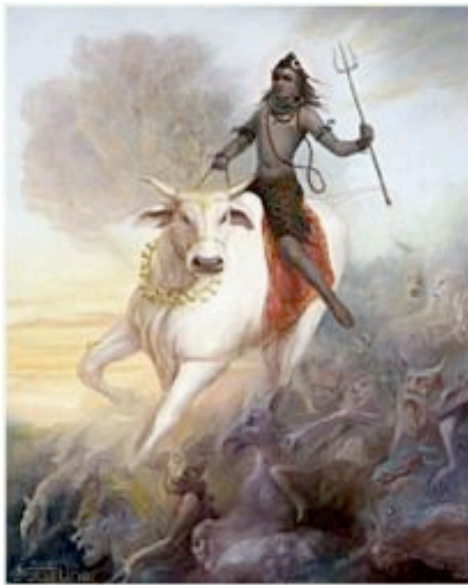
Shiva Riding Nandi